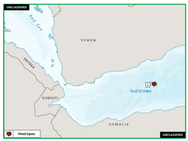
(U) Figure 1. East Africa Piracy and Armed Robbery at Sea