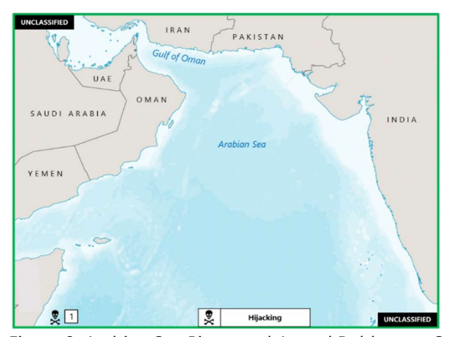
(U) Figure 2. Arabian Sea Piracy and Armed Robbery at Sea

1. (U) INDIAN OCEAN: On 13 May at 1338 UTC, six or seven pirates armed with automatic rifles hijacked an Iran-flagged fishing vessel approximately 69 NM east of the Somali coast (120 NM southeast of Eyl, Somalia) near position 06:20N – 052:05E. The pirates released the 21 crew and the fishing vessel after stealing food and logistical supplies. After the fishing vessel's release, an Indian Navy warship located, boarded and later escorted the fishing vessel to a safe location. (Clearwater Dynamics; Maritime Executive; IMB)