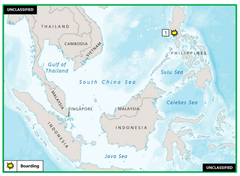
(U) Figure 3. Southeast Asia Piracy and Armed Robbery at Sea